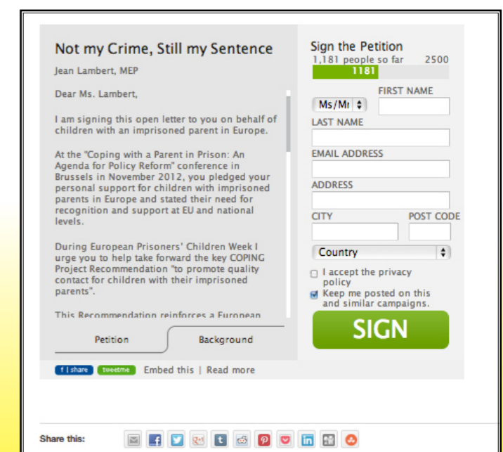
Screenshot of the English Petition Widget