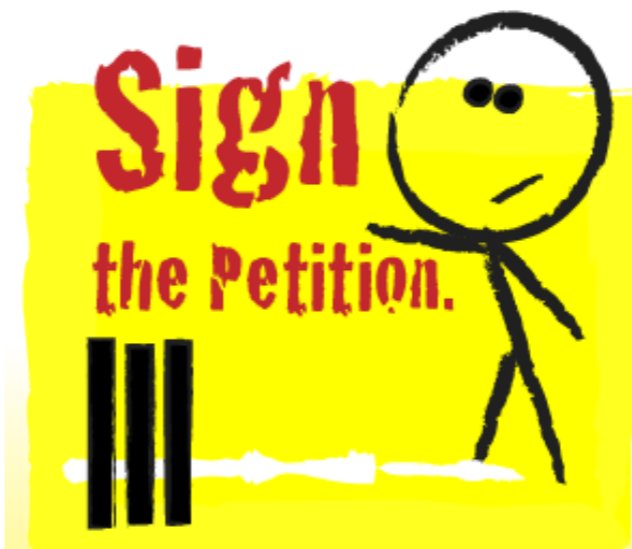
Screenshot of the English E-button