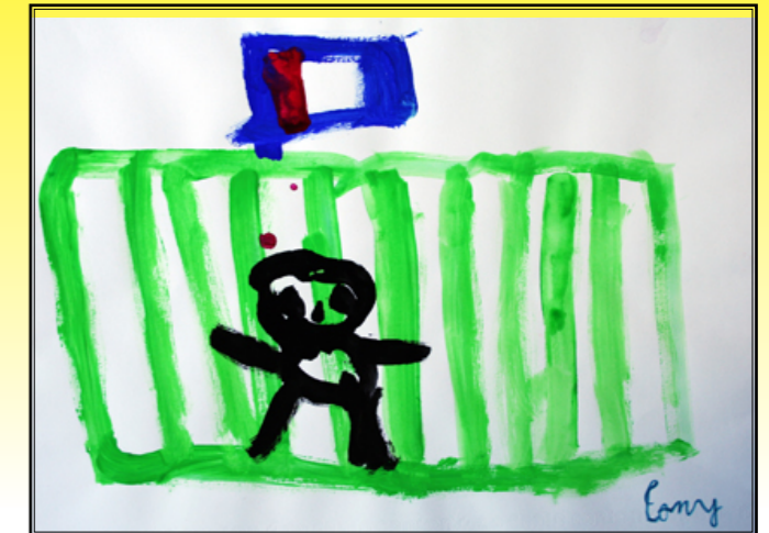
Examples of the artwork created by children whilst waiting to see their parent in prison (above and top right)