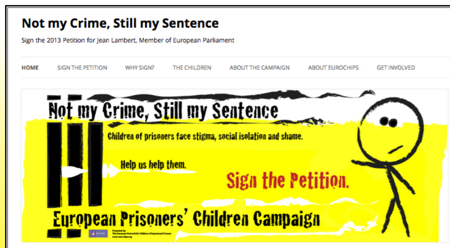
Screenshot of the Campaign Site

Posters, e-buttons and petition widgets were available in the 10 languages