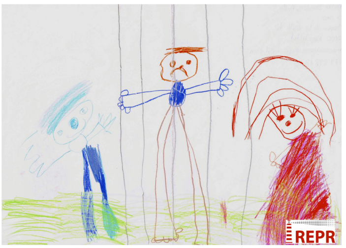
Drawing by Aida, one of five winners in Relais Enfants Parents Romands' 2017 art contest "Laura and Max visit their dad in prison": <a href="http://www.repr.ch">http://www.repr.ch</a>

The views expressed in these articles do not necessarily reflect those of Children of Prisoners Europe, except where indicated.