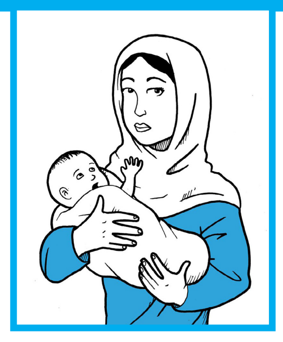
Drawing from the Penal Reform International website

clude information on caretaking responsibilities. Failure to ask women prisoners at admission to voluntarily register any children hinders the prison administration's duty to facilitate contact with family, including their children, which is a crucial part of the successful rehabilitation of prisoners (see Bangkok Rules, Rules 6 on registration and 26 on facilitating contact).