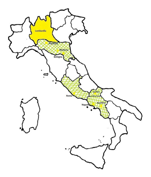
From a regional to a national network: the regions in Italy where Bambinisenzasbarre's Spazio Giallo project is already present and active.

Bambinisenzasbarre maintains that in Italy, 100,000 children visit their parent in prison every year (flow rate). In Milan, 5,000 children visit the city's three prisons: San Vittore, Bollate and Opera. Every child is granted six to eight hours of visits, which more of less amounts to a weekly visit with their imprisoned parent. This is the only way to maintain the essential bonds with their parent. Visiting a prison is a fine balancing act for all children, between what is likely to have a strong emotional impact and what could potentially have a traumatic one.