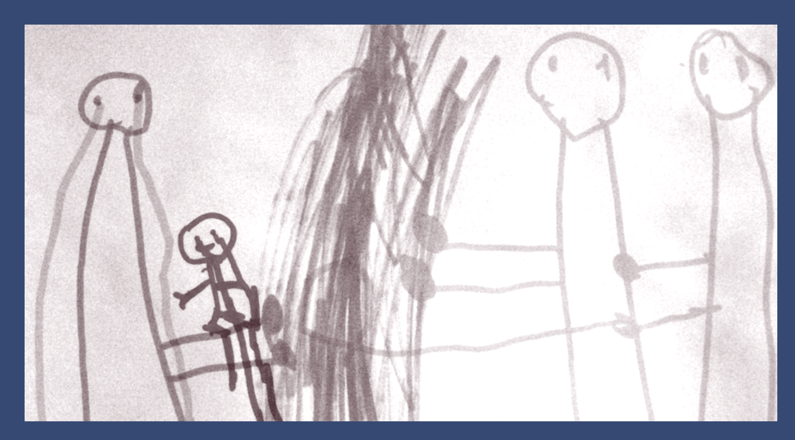
Boy, aged 3, Italy