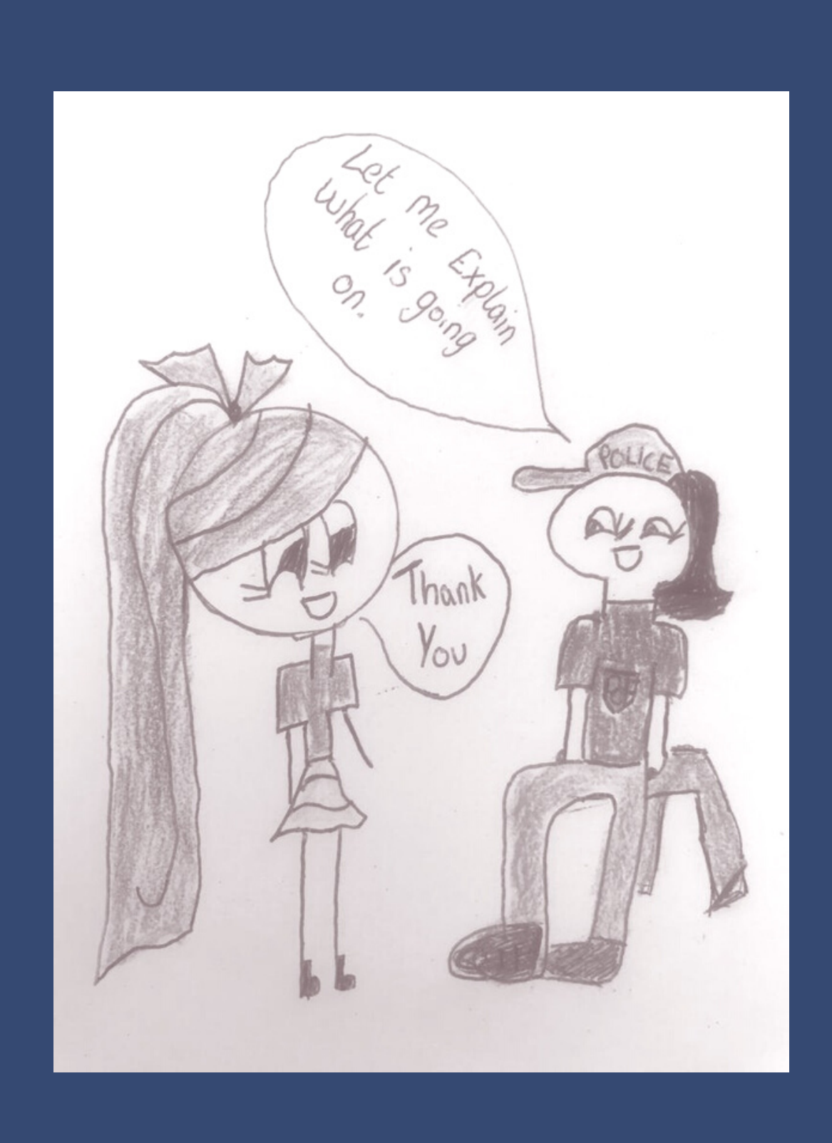
LOIS, aged 12, England

This document offers an overview of the critical role the police can play in protecting the rights and needs of children with a parent in conflict with the law. It contains a brief summary of key considerations; salient guidelines outlined in the Council of Europe's landmark Recommendation CM/Rec(2018)5; and links to further tools and materials COPE has created to support the police.