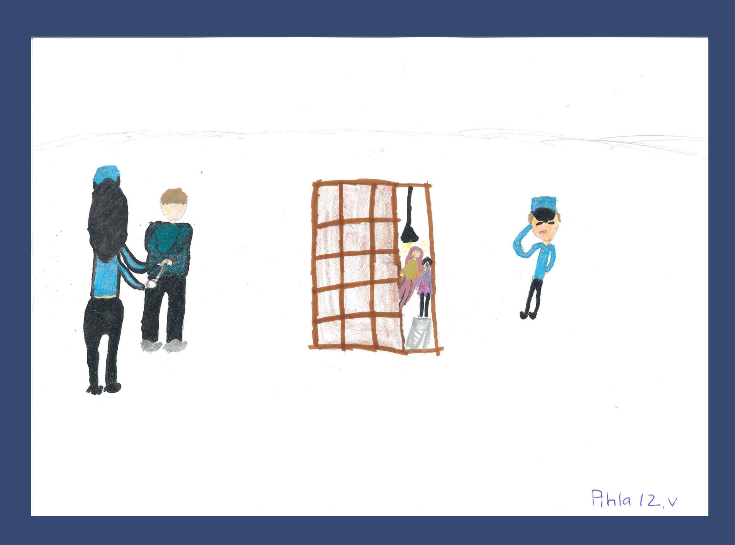
PILHA, aged 8, Finland

Recommendation CM/Rec(2018)5 of the Committee of Ministers to member States concerning children with imprisoned parents